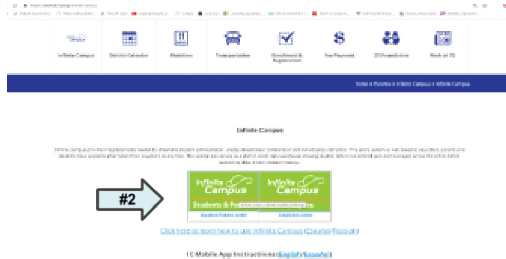
#2 Parent/Student Link