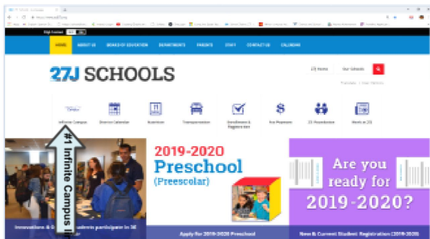
#1 Go to the District website http://sd27j.org . Click on the Infinite Campus link (on the left side of the screen). Then click on the Infinite Campus Parent link.

This guide includes screenshots that will show you how to navigate through the Infinite Campus Parent Portal